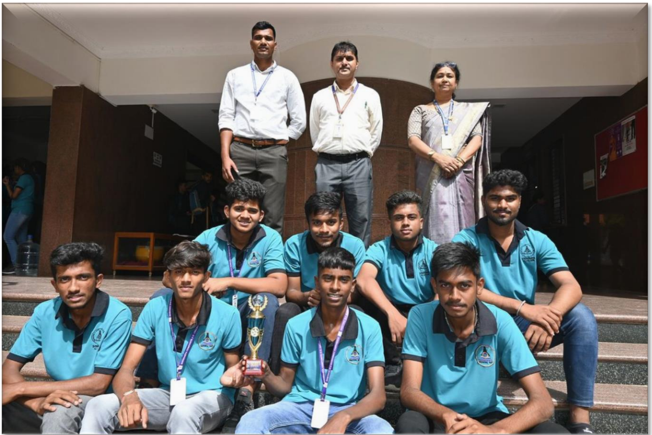
SOUNDARYA HANDBALL TEAM FSA Cup – 2023, held at Vidyananyapura, Bengaluru – Secured 3 rd Place