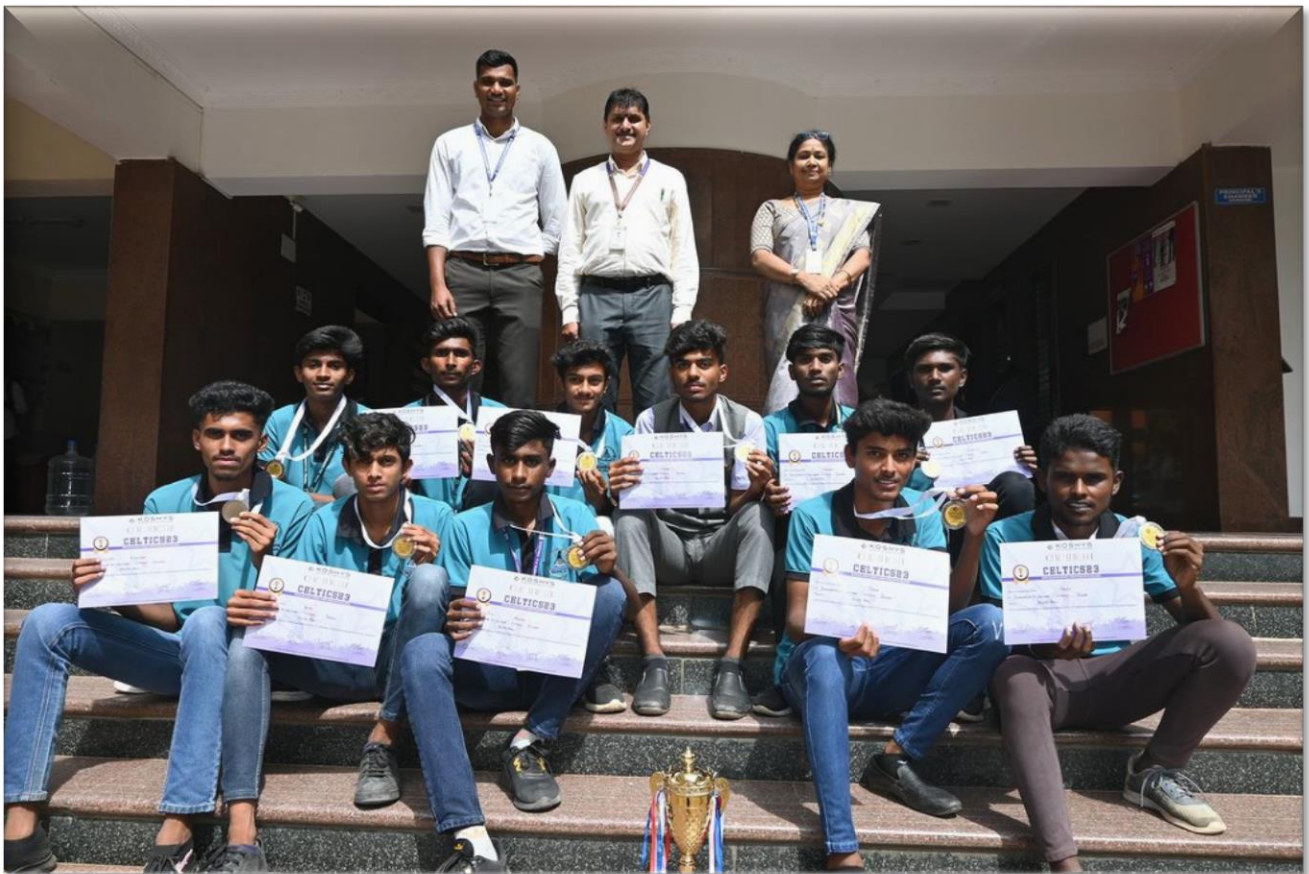
SOUNDARYA VOLLEYBALL TEAM – Celtics Cup 2023 held at KOSHYS GROUP OF INSTITUTION and Secured 1 ST Place - GOLD Medal.