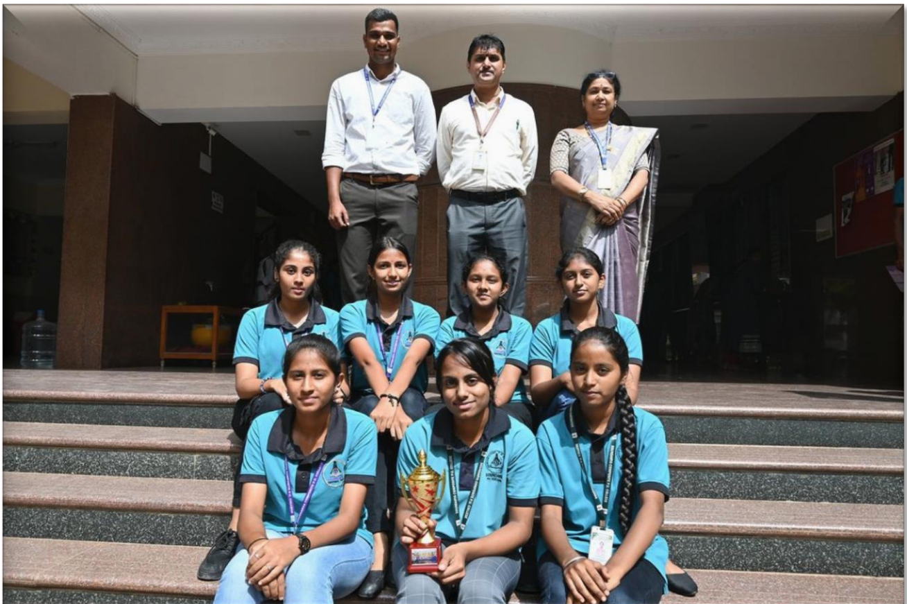
SOUNDARYA HAND BALL TEAM (GIRLS) FSA Cup – 2023, held at Vidyananyapura, Bengaluru – Secured 2 ND Place